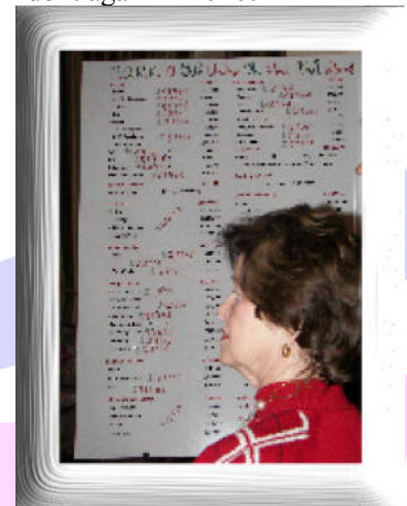
Janie Hathoot looks at the different gift options on the gift board.

Thanks to everyone who parked a gift under someone's tree in their honor for P.A.R.K. We'll do it again in 2010!